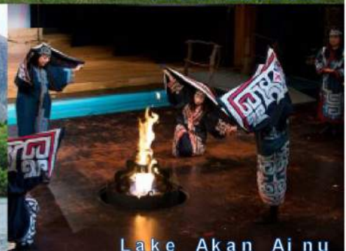
Lake Akan Ainu