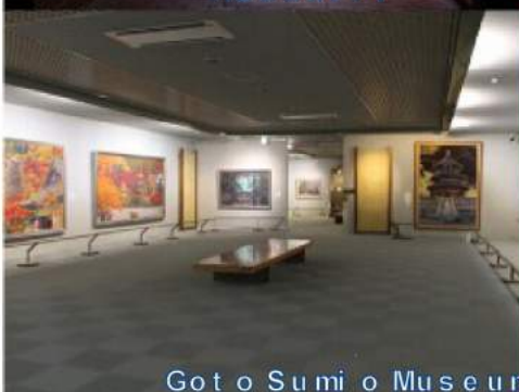
Got o Sumi o Museum